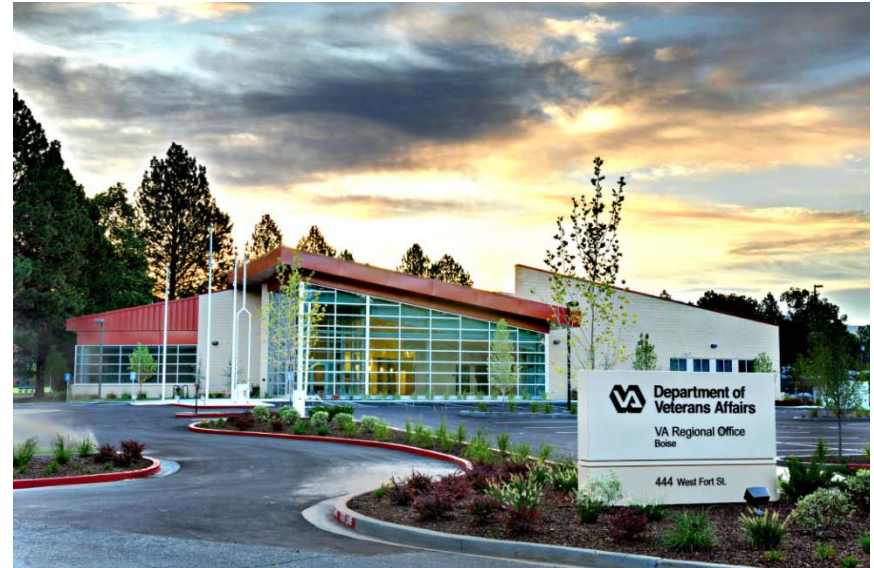
Boise VBA Regional Office – LEED Gold