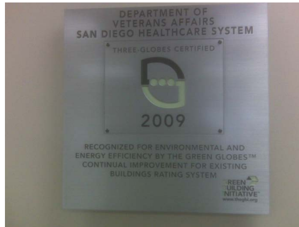
Green Globe certification for San Diego VAMC